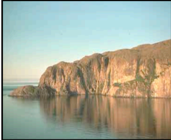
Great Slave Lake